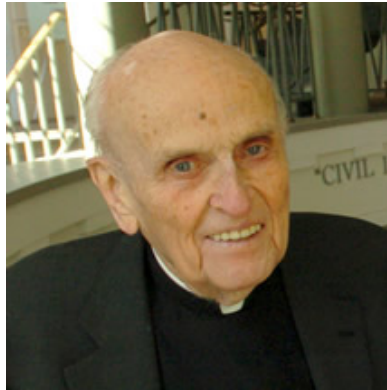
Robert F. Drinan, S.J.

members of the U.S. military who served as physicians to discuss the mission of GLP, i.e., how doctors and lawyers could work together to promote basic human rights in the context of our on-going war. He supported the initiative, but because we had scheduled the meeting for July 5 said he would not likely be able to attend. He had family in Massachusetts, and made it a point to spend all important holidays—including the 4 th of July—with them. He kept his priorities straight. We will all miss him, but will proudly carry on his work.