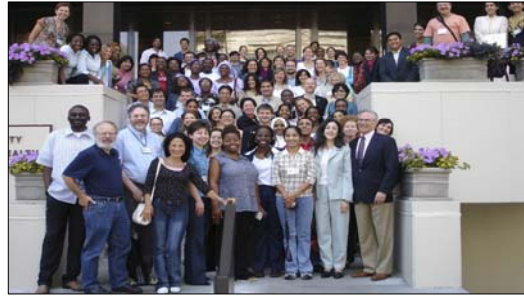
2006 Graduating Class